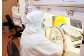
Negative pressure isolators : preparation environment

Using a complete protocol including critical operations of cytotoxic preparation, 12 operators were tested. Each operator used vials of quinine diHCl powder, resulting in a 0.1 M solution after reconstitution. Different devices were used to fill syringes and perfusion bags, with or without an administration set. For each operator, all the filled containers and material were collected at the end of the protocol and washed by a validated method. The obtained solution was analyzed by fluorimetry (LOQ=0.5 µL) for the rate of contamination. The number of spots on the working pad was counted under UV light.