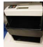
UV Lamp (CAMAG)