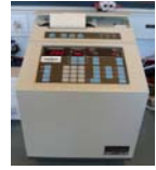
Fluorimeter Perkin Elmer LS 40