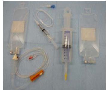
Material used for the validation of the operators